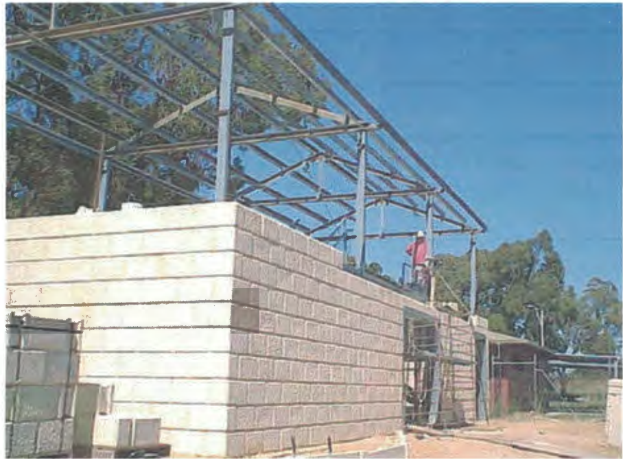
Blockwork on the new NDMES Club House reached first floor level in November.

NDMES PO Box 681 Balcatta 6021 Western Australia