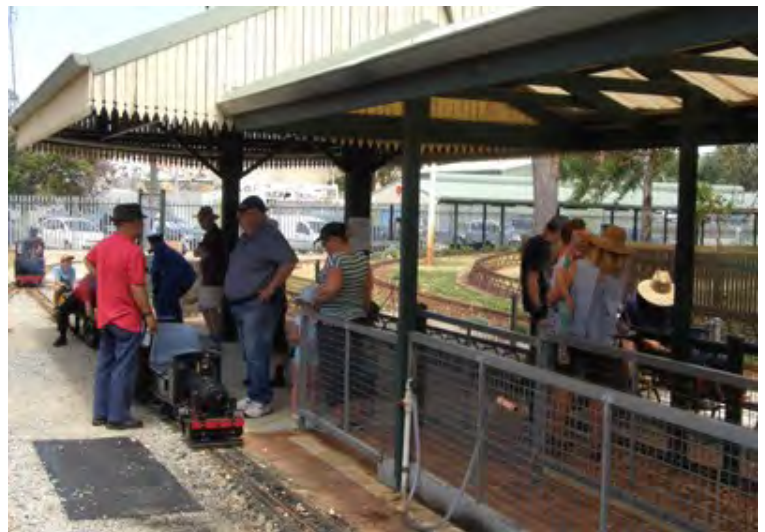
Not the usual crowds at the station, but plenty of track action for those who wanted it.