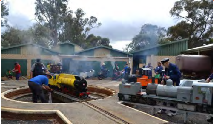
Plenty of smoke as the locos are steamed up on the Saturday morning.

Total registrations were about 140 and the Saturday night dinner in the clubrooms was attended by about 60 people. The weather was perfect (after the threat of early rain on the Saturday) and the traditional camaraderie was much in evidence.