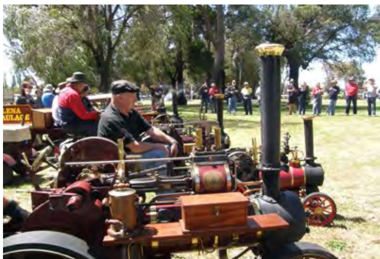
An impressive line-up of traction engines turned out in perfect weather for the Grand Parade on Saturday.