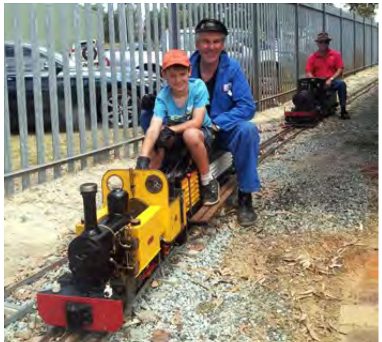
A good day to get some driving experience.