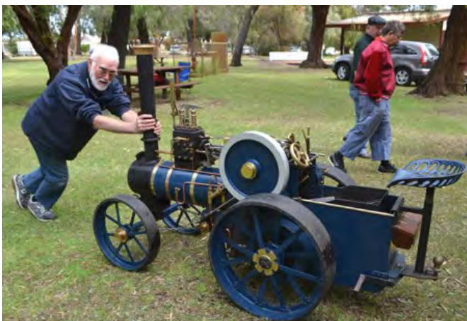
Not the way it's supposed to go, Lindsay!