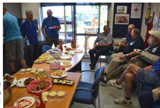
Right: It was quite a spread the Men's Shed laid on!