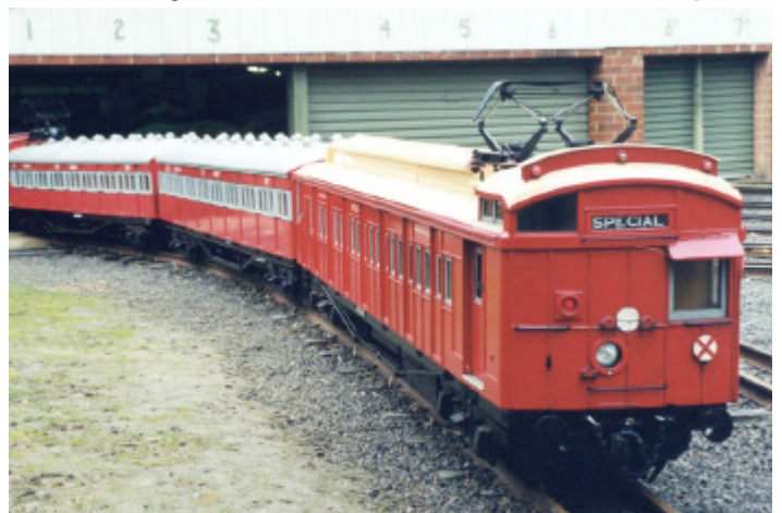
Model or the real thing? This impressive consist seen outside Diamond Valley's Railway Workshops.